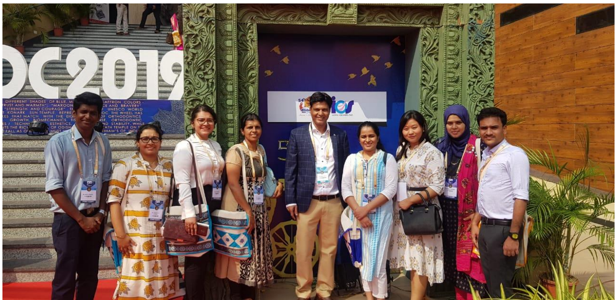
BHUBHANESHWAR IOS CONFERENCE