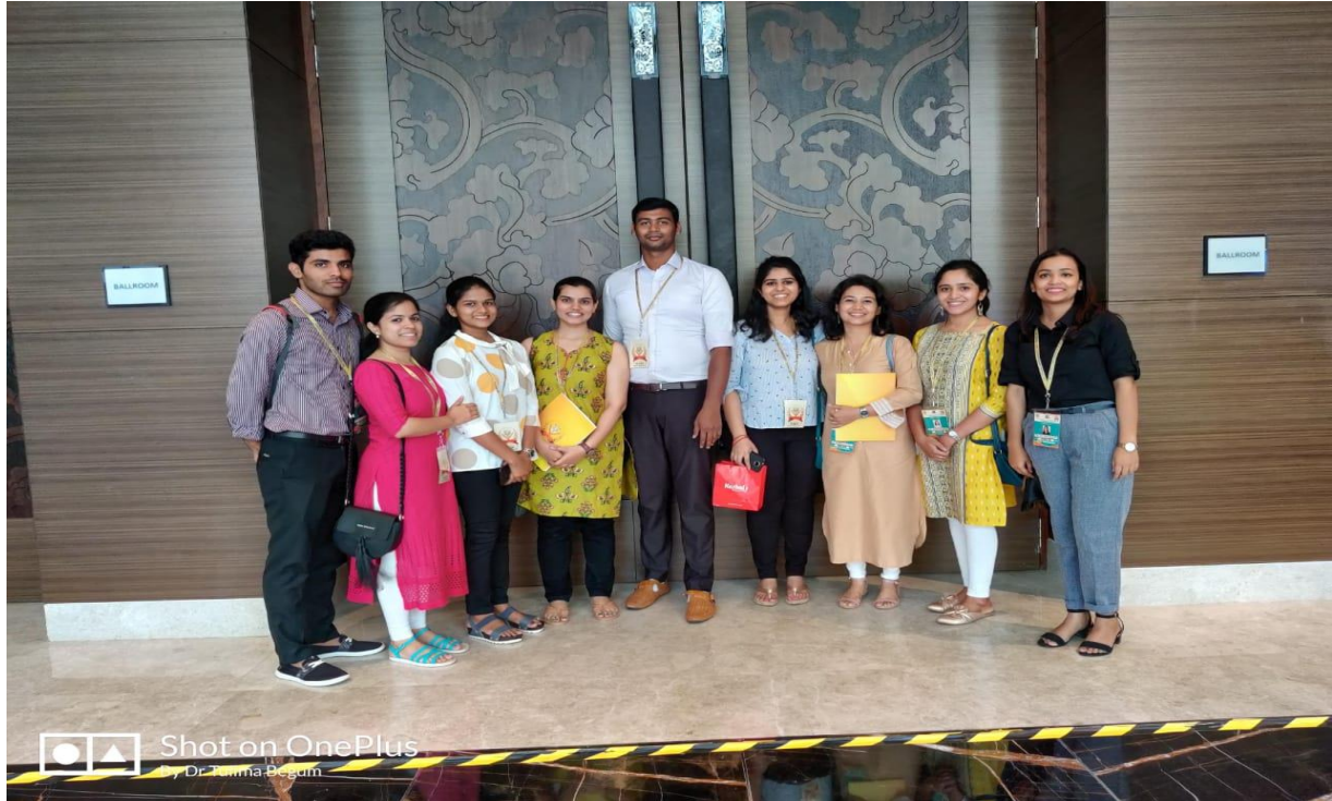
ORAL SURGEERY CONFERENCE BANGLORE