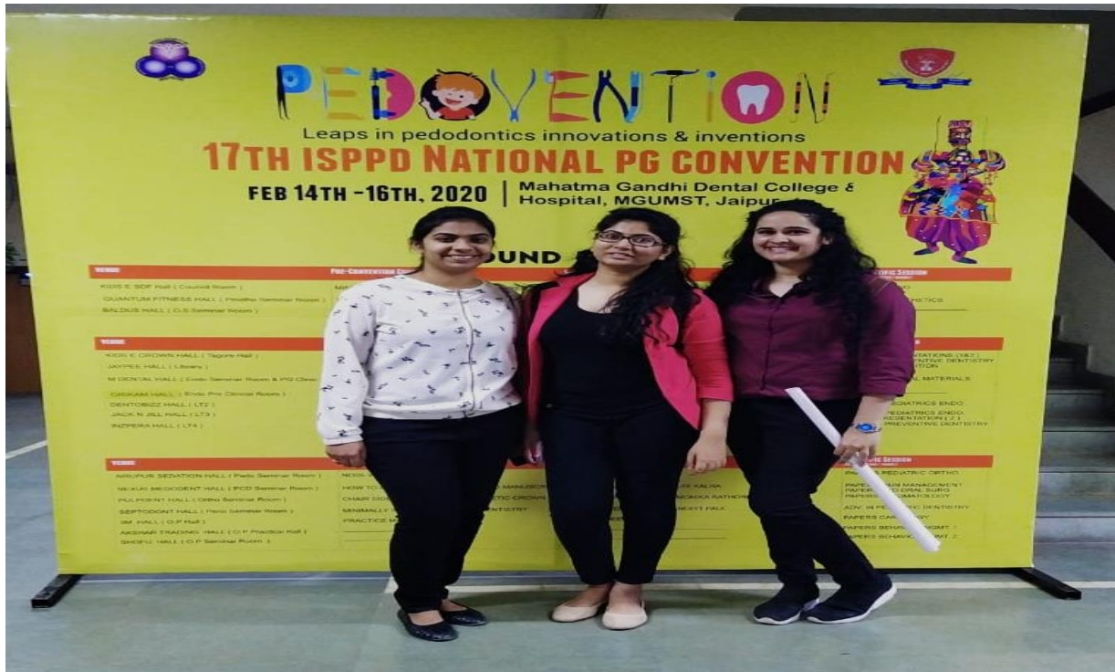
PEDODONTIC CONFERENCE, JAIPUR