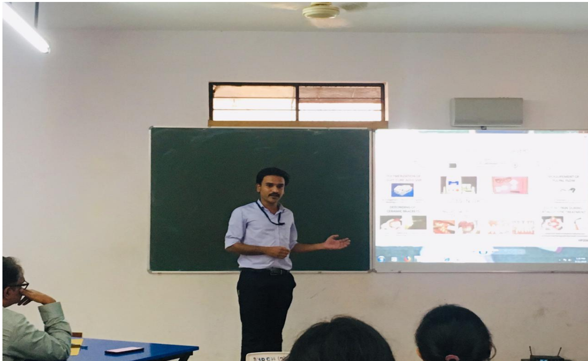
SCIENTIFIC POSTER PRESENTATION