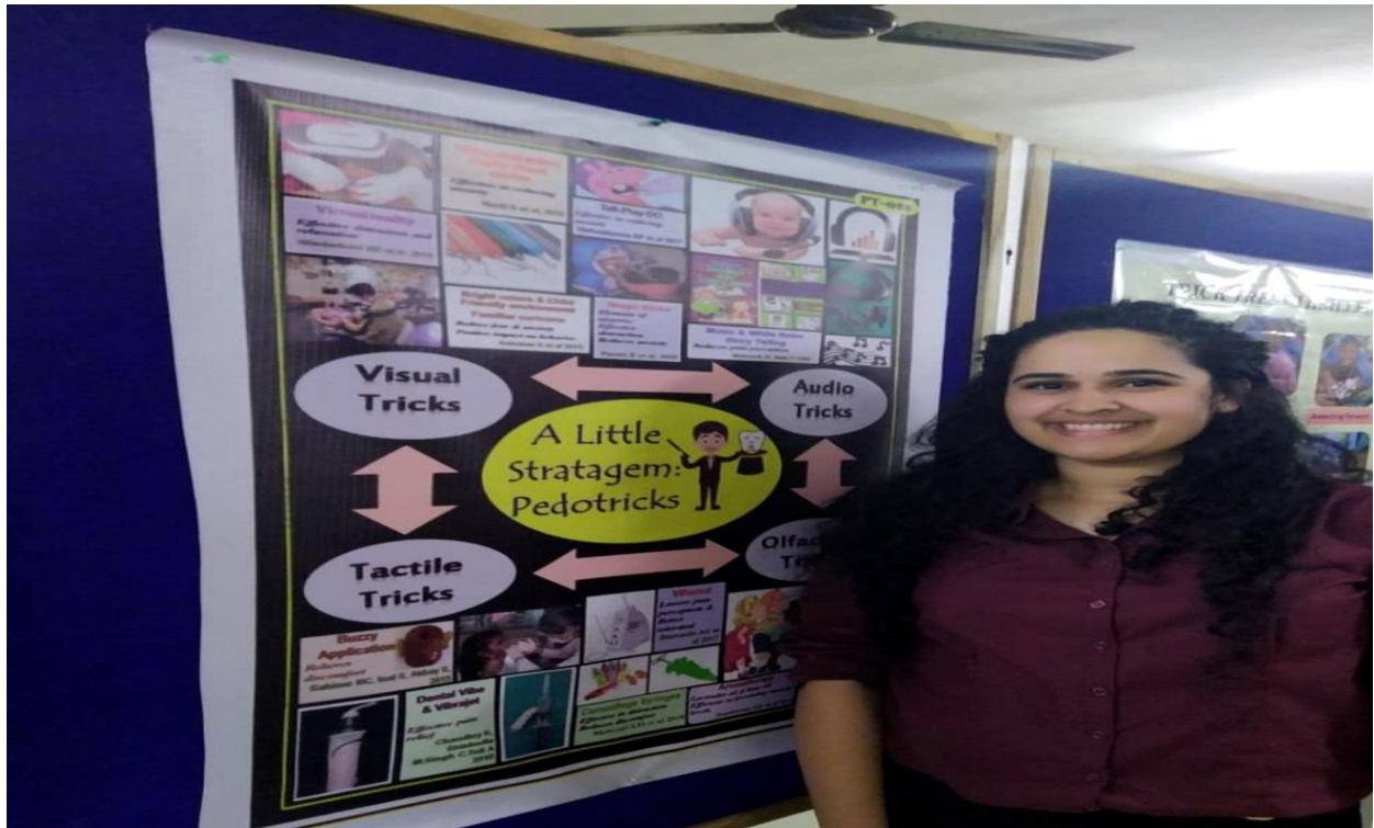
SCIENTIFIC POSTER PRESENTATION